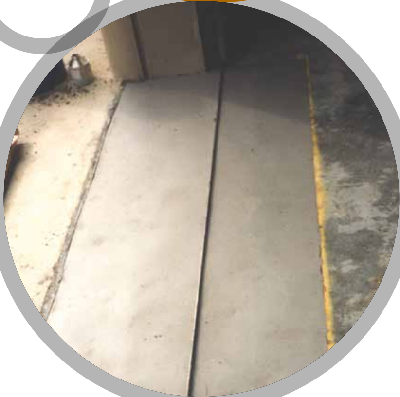
Floor problem areas

For more information, please contact your local Belzona representative.