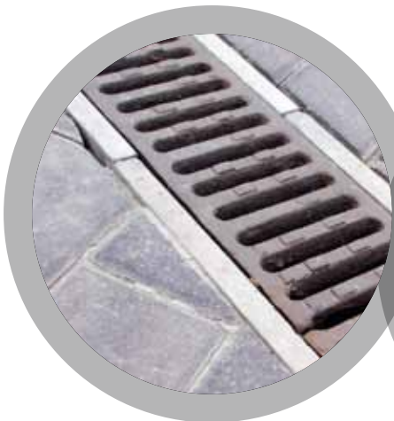
Channels and Gratings